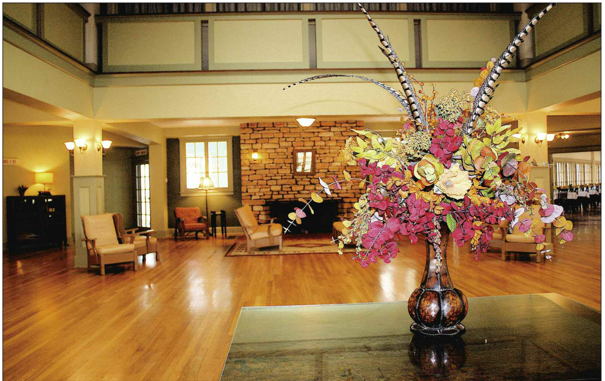
Wildwood's great room transforms into a sea of couches and comfortable chairs during concert weekends when the performers take the "stage" in front of the fireplace.

Wildwood Springs Association that built the lodge made the grand opening a day of celebration with a BBQ, a parade, and contests. Wildwood's own orchestra performed as visitors toured the lodge. In the early days, visitors traveled by train to Cuba,