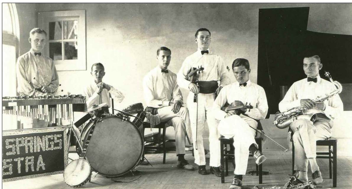
The Wildwood orchestra played at its opening ceremonies. The early Wildwood Orchestra began a musical culture that the lodge still fosters.

with their well-known signatures, often touting the fine food they have eaten.