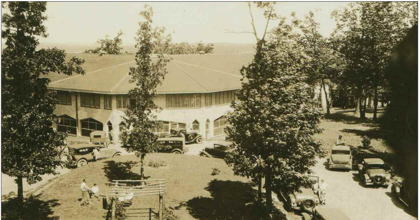
Families have always enjoyed Wildwood. This old photograph from the late 1920s with the cars of the day shows that the lodge has maintained its vintage atmosphere.