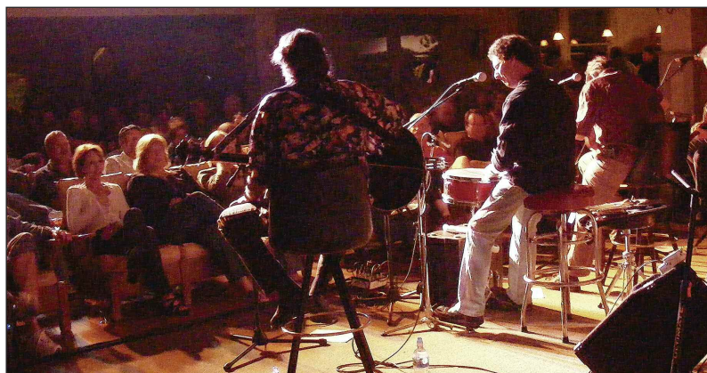
Pure Prairie League's performance in front of a sold out crowd in one of the "Living Room Concerts" showcases the intimate atmosphere between performers and audience.