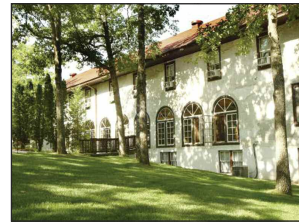
The exterior of the dining room showcases the windows that still provide the Ozark vistas for diners.

The lodge preserves its history in spirit and décor. In 1922, contractor R. H. Hummel planned a two-story frame building that would be a “magnificent, commodious, and strictly modern resort hostelry.” The resort opened on Memorial Day 1922. The